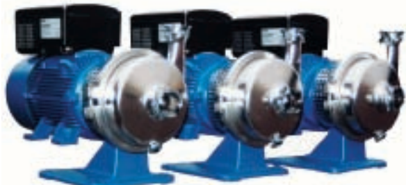
Kalrez® parts in pumps and valves help maintain purity in process fluids and meet critical health and safety requirements.